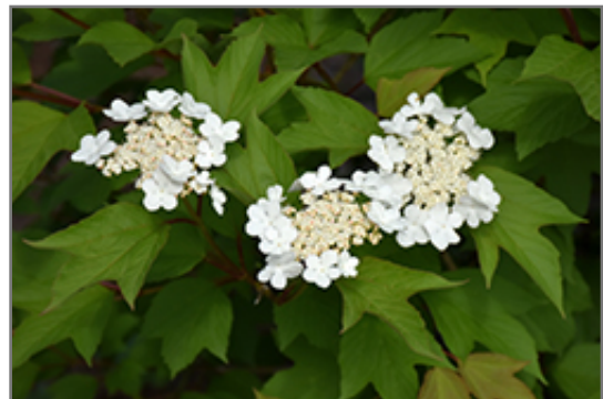
Redwing Highbush Cranberry flowers