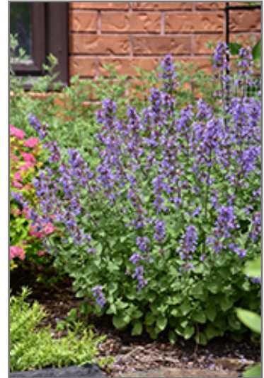
Picture Purrfect Catmint flowers

Picture Purrfect Catmint is a dense herbaceous perennial with a mounded form. Its relatively fine texture sets it apart from other garden plants with less refined foliage.