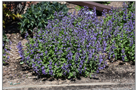
Picture Purrfect Catmint in bloom