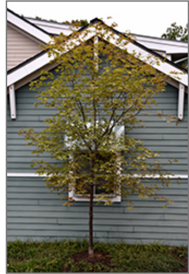
Cinnamon Girl Paperbark Maple in fall