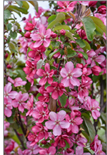
Red Barron Flowering Crab flowers