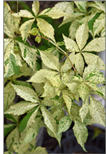
Star Showers Virginia Creeper foliage